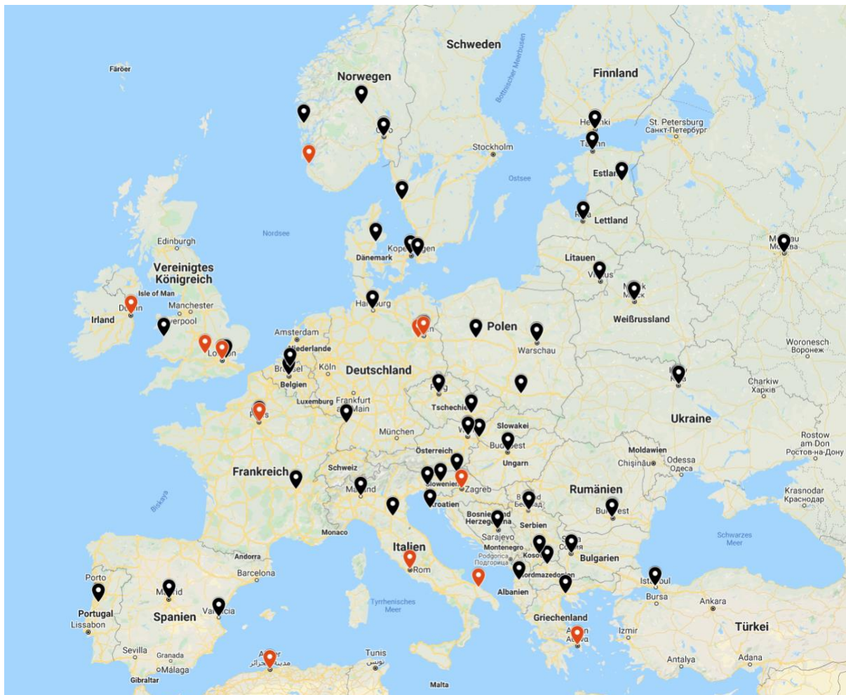
Find the full interactive map here .

Arbeitskreis Kulturwissenschaftliche Zeitschriftenforschung, Booksa, Dublin Review of Books, Einstein Forum, Fondazione Di Vagno, Free Speech Debate, Historein, ICORN, Internazionale, Kulturpunkt.hr, NAQD, Public Seminar, openDemocracy, VoxEurop